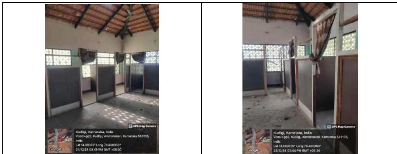
Store rooms/ Kiosks