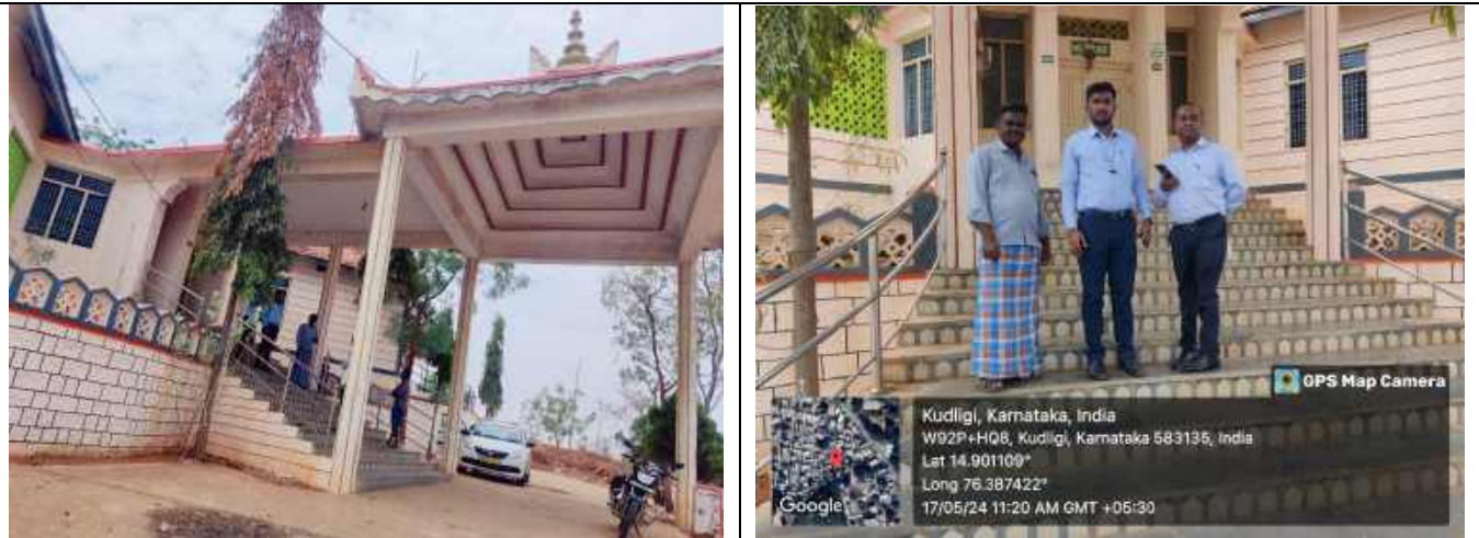
Exterior view of the property